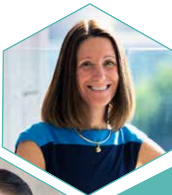
Finance and Operations Manager